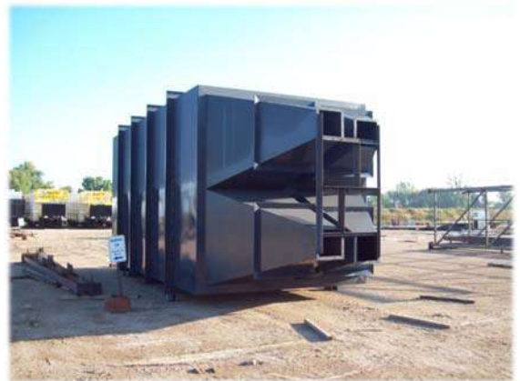
Custom Cone Hoppers