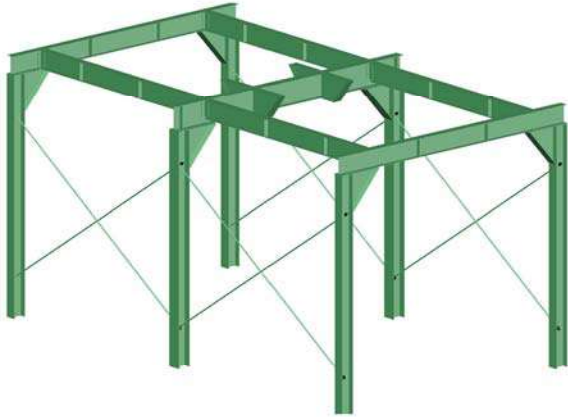
Hopper Tanks Structure