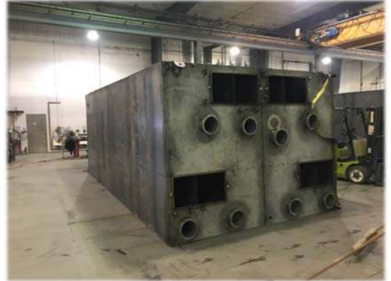
Custom Inlets & Tank Orientation