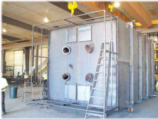
Prefabricated Access Railing, Ladder, etc